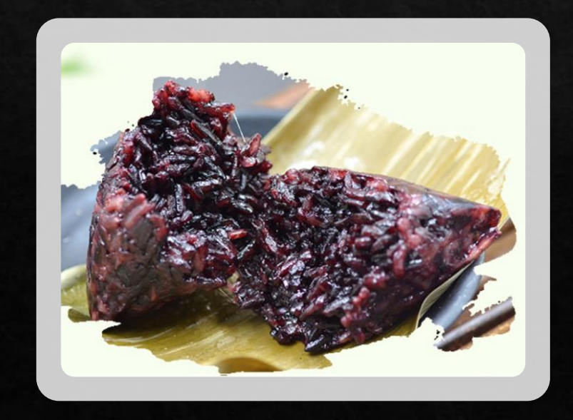
Common Types of Sweet Zongzi 常见的甜粽子