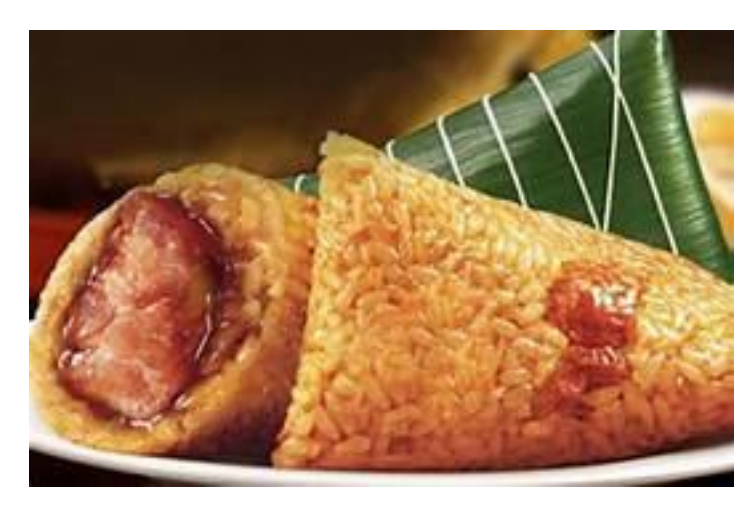
Common Types of Salty Zongzi 常见的咸粽子